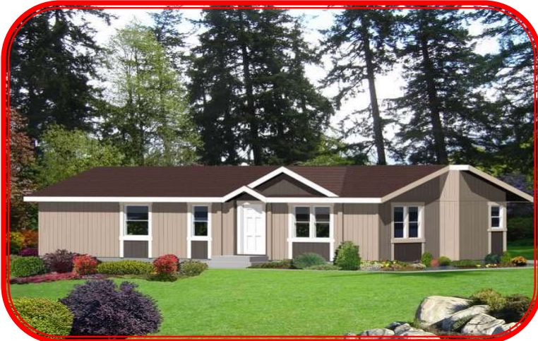
Exterior Rendering Representative. Actual Model May Not Be Shown.