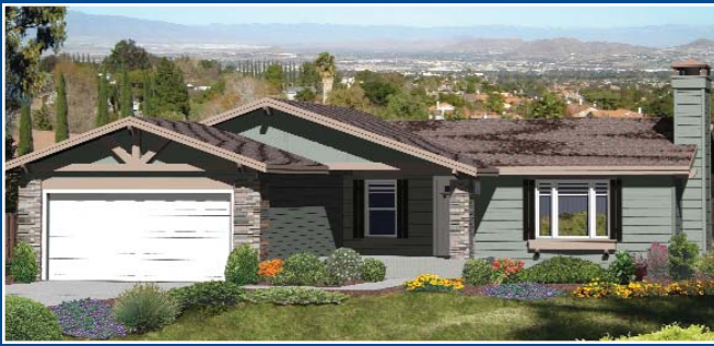
OPTIONAL ELEVATION A - STANDARD 4:12 ROOF