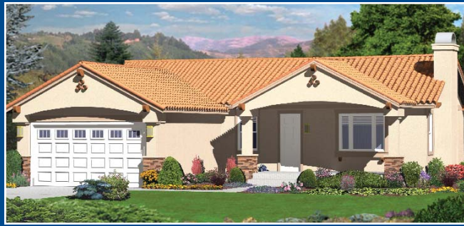
OPTIONAL ELEVATION B - OPTIONAL 6:12 ROOF