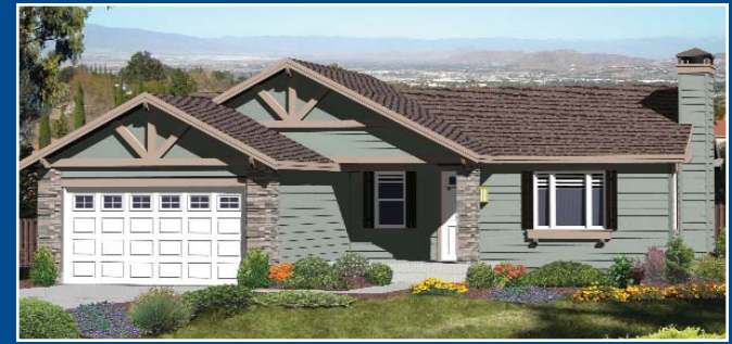
OPTIONAL ELEVATION C - OPTIONAL 6:12 ROOF