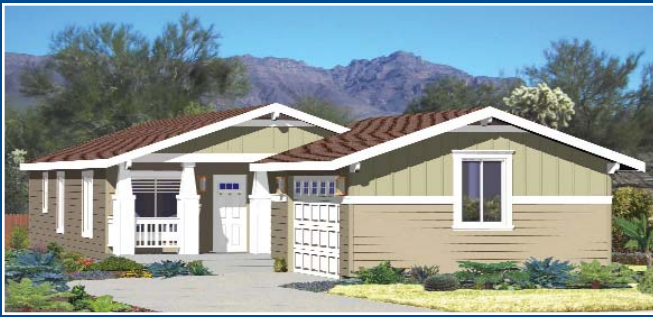
OPTIONAL ELEVATION A - STANDARD 4:12 ROOF