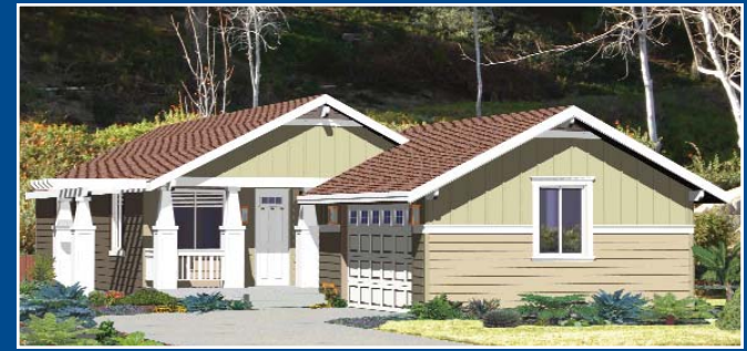
OPTIONAL ELEVATION C - OPTIONAL 6:12 ROOF