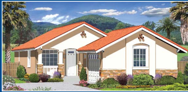
OPTIONAL STUCCO ELEVATION B - OPTIONAL 6:12 ROOF