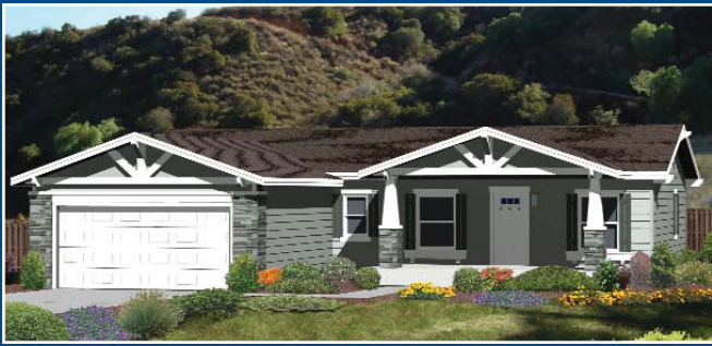
OPTIONAL ELEVATION A - STANDARD 4:12 ROOF