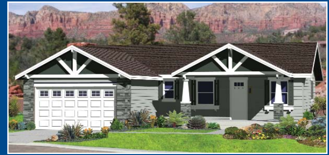
OPTIONAL ELEVATION C - OPTIONAL 6:12 ROOF