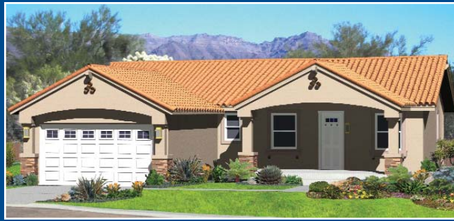
OPTIONAL STUCCO ELEVATION B - OPTIONAL 6:12 ROOF