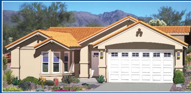
OPTIONAL STUCCO ELEVATION B - STANDARD 4:12 ROOF