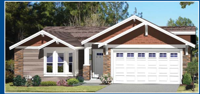
OPTIONAL ELEVATION C - STANDARD 4:12 ROOF