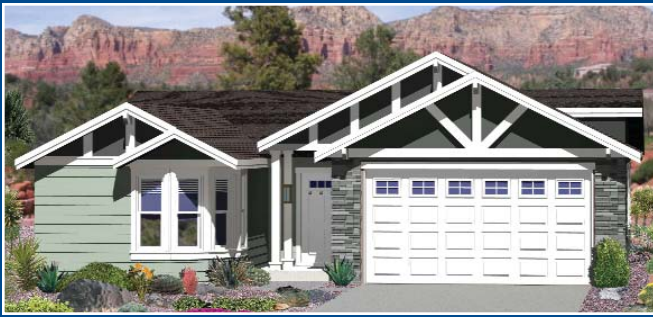
OPTIONAL ELEVATION A - STANDARD 4:12 ROOF